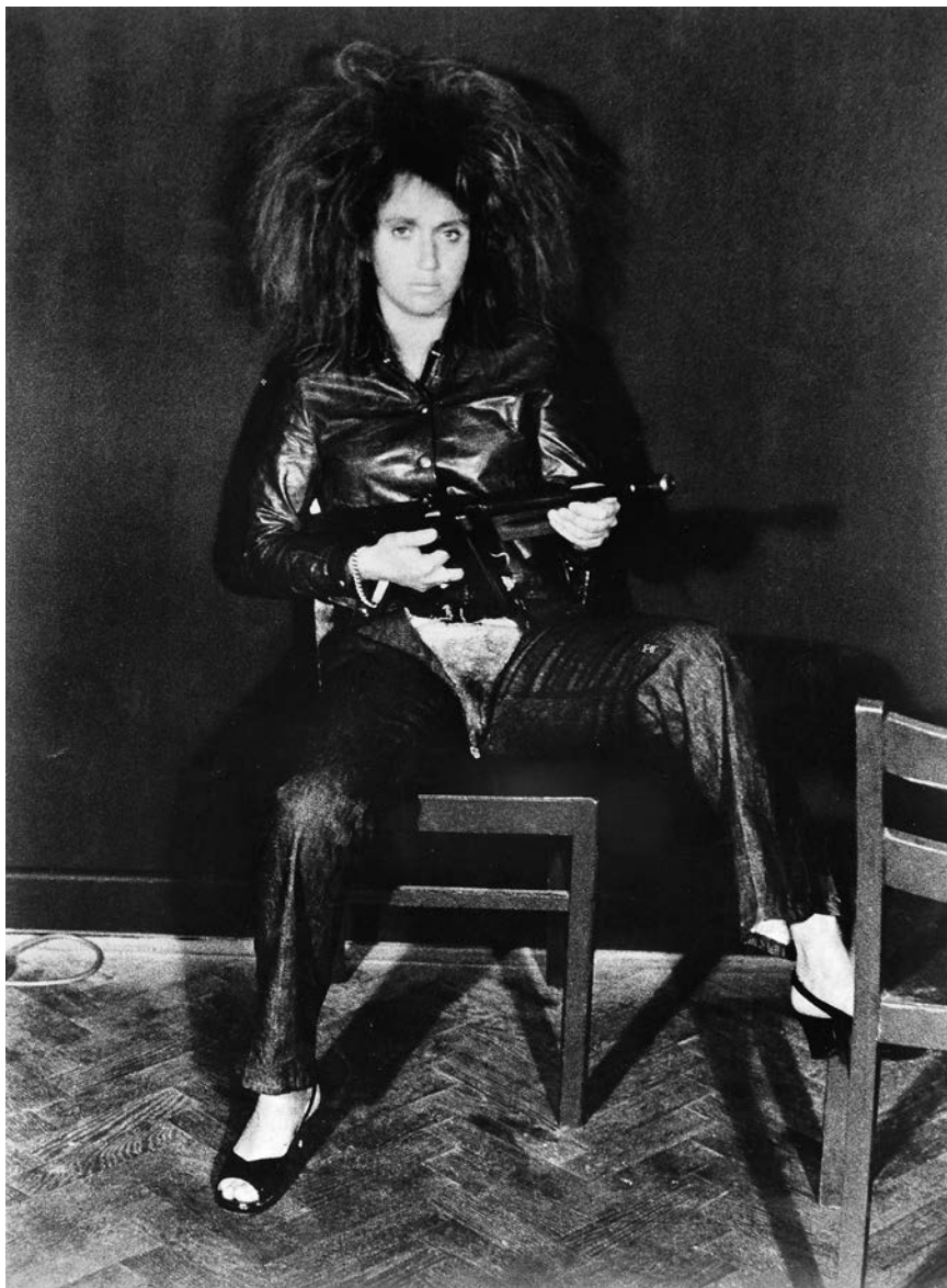
Fig. 2. VALIE EXPORT, Action Pants: Genital Panic , silver gelatin print mounted on aluminum, 65 × 48 in, 1969/2001.

woman in the audience experienced an intense hour-long eye-locked encounter, an occurrence that generated much discussion after the performance. This discussion too is a substantial part of repeating the original, through rumors and word-of-mouth. Spectators and art critics have commented on this encounter as one of the most intense moments of the seven night series. Johanna Burton writes, for example, “those present were held captive by a nearly hour-long, wordless exchange between the artist and a young woman brave enough to inch up to the closely guarded platform. After both parties succumbed to tears, Abramović released her gaze, the girl departed” [22]. The prose of this critical review reflects and multiplies the event of the encounter, making the performance available as a personal narra-